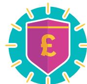
How to stay safe