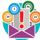
Prize draws and lottery scams