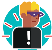
What is fraud?